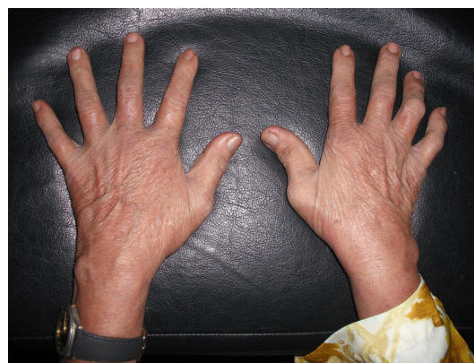
Fig. 2: Rheumatoid arthritis deformities of the hands: Z thumb, Boutonniere deformity and subluxation of the carpal bones.

cataract. The left eye showed a severe peripheral corneal thinning extending from One o'clock to 10 o'clock hour position in the limbus (Figure 1). The thinning stained with fluorescein indicating a lack of epithelial integrity. A 'self-sealing' corneal perforation with iris plug was seen at the six o'clock limbus with no aqueous leakage (negative Seidel test). The anterior chamber was deep and filled with inflammatory cells with an organised hypopyon inferiorly. There was no view of the posterior segment in the left eye.