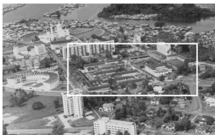
Aerial view of the Brunei General Hospital and enlarged image of the insert with labels of the various parts of the complex.